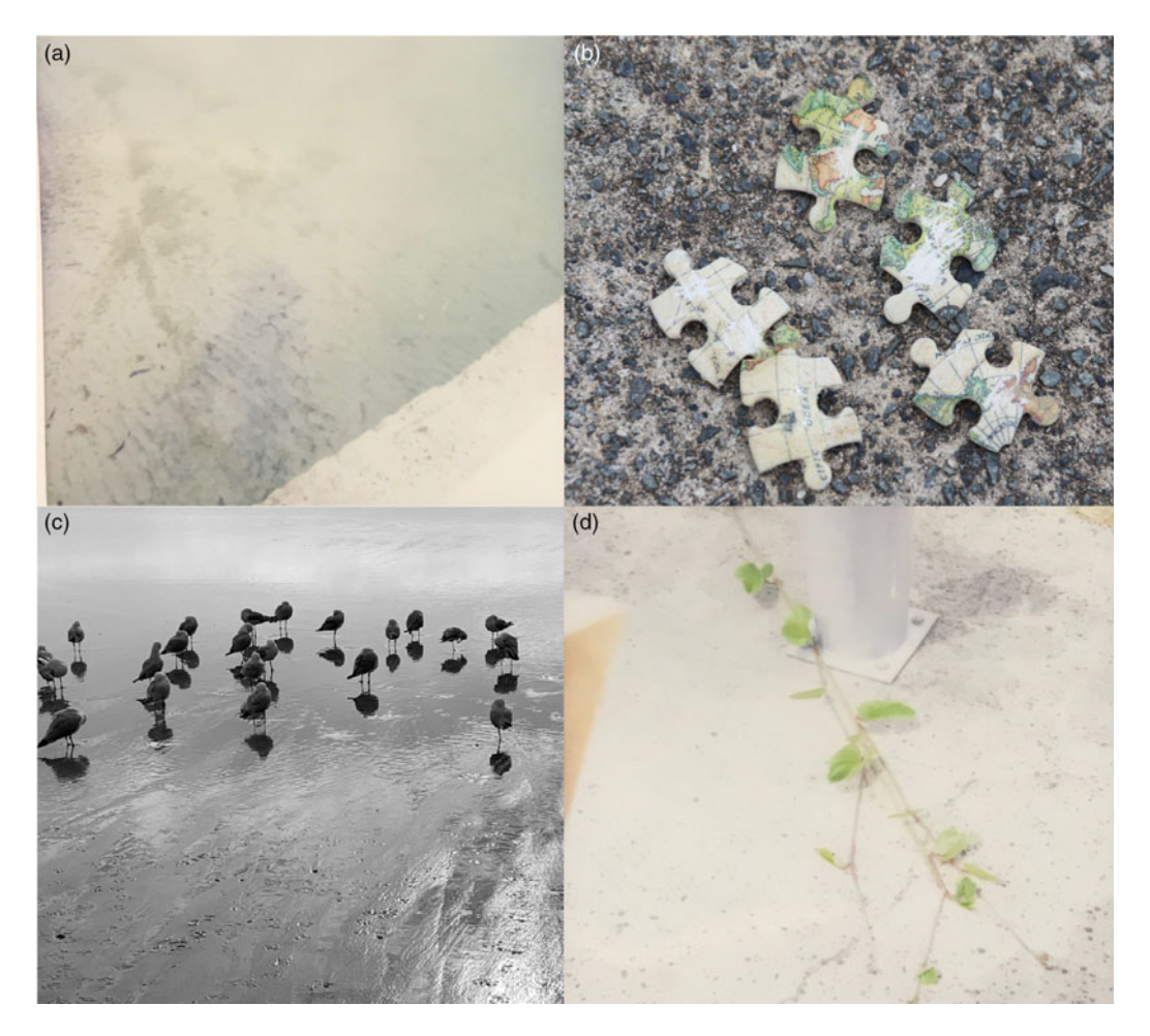
Figure 1. Series of photographs walking-with Deborah Bird Rose.

the extinction cascades, the extinction vortexes' . . . Alongside some sparkling broken glass, pieces of puzzle catch our eyes, strewn across a concrete path, from a puzzle of the globe — fragmented, scattered, shattered — fragmenting ecosystems — cascading extinctions . . . 'not only life and life's shimmer but many of its manifold potentials are eroding. (Rose, 2017, p. 55)