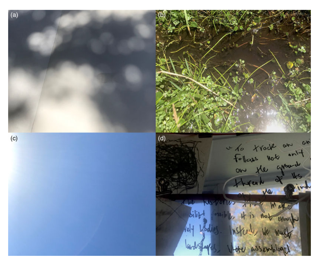
Figure 2. Series of photographs from concept development workshop of 'Theories of lines, knots and knotting'.

We are drawn to the sense of loss, of grief, of beauty, and of gratitude. Ecological pulses come from and enable new possibilities of the experiences of ancestral power. The pulses of ancestral experience and ancestral aesthetics lure our attention and offer rewards. Our senses are heightened, and we attune to the brilliance.